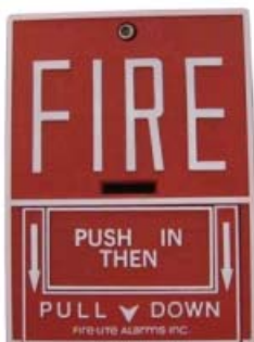
BG-10 series manual pull station, Fire-Lite BG-10 shown

Honeywell recently announced a potential defect with their BG-10 series pull stations. These pull stations were manufactured from 1992 through 2010 under multiple brands including ADT, Fire-Lite Alarms, Johnson Control Inc. and Notifier. Over time, deterioration inside the devices can occur, preventing the pull stations from transmitting an alarm signal when activated. Examples of the BG-10 pull stations are provided below. All BG-10 series pull stations will look similar to those shown.