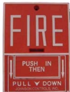
BG-10 series manual pull station, Johnson Controls Inc. JBG-10L shown