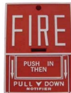
BG-10 series manual pull station, NOTIFIER NBG-10 shown